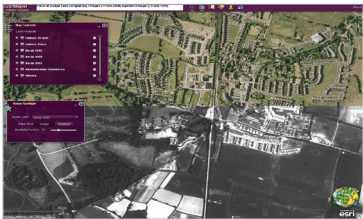
Historic Mapping Swipe Tool

GIS is helping to usher in a new era of cross-departmental collaboration at Fingal County Council. With its JustMaps! application, the council expects to be able to deliver a higher standard of service to citizens, reduce costs and operate more efficiently. For example, if employees in the water department share data with employees in the traffic department, road works and water pipe maintenance in the same street can be planned at the same time. Fewer holes need to be dug, which saves time and money, but also minimises disruption to commuters and local residents.